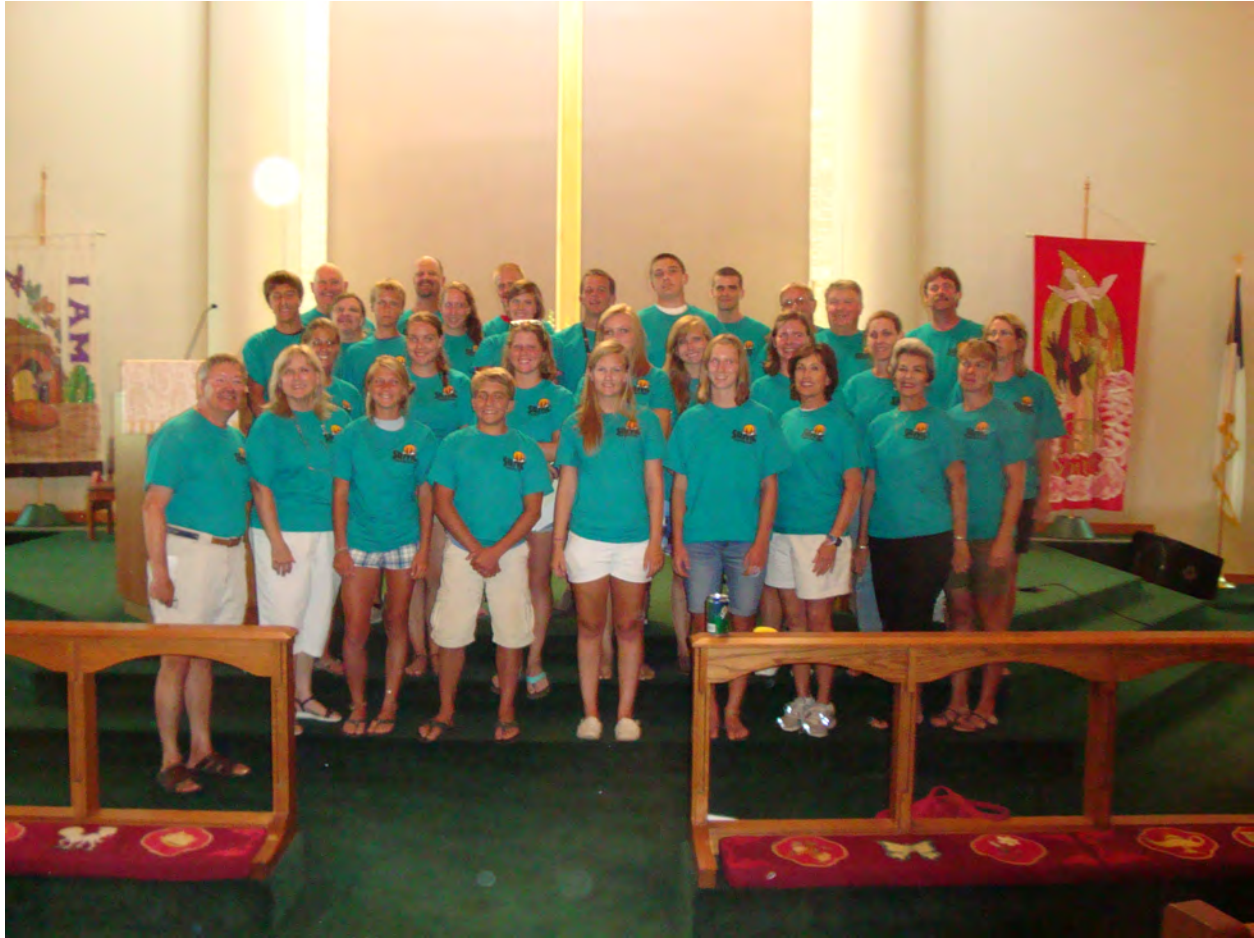
Team Commissioning Service Picture - SUMC 6/18/11